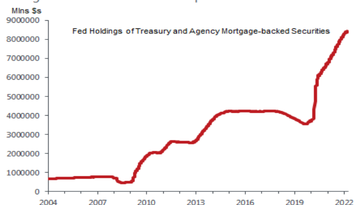
Surge In Fed's Balance Sheet Suppressed Bond Yields

of balance sheet reduction that was highlighted in the minutes and Brainard’s comments, which spurred a more significant response in long-term yields. The huge $4.5 trillion build-up in the Fed’s balance sheet since the onset of the pandemic was designed to keep long-term interest rates low. Conversely, the planned $1.1 trillion asset reduction over the coming year is expected to have the opposite effect.